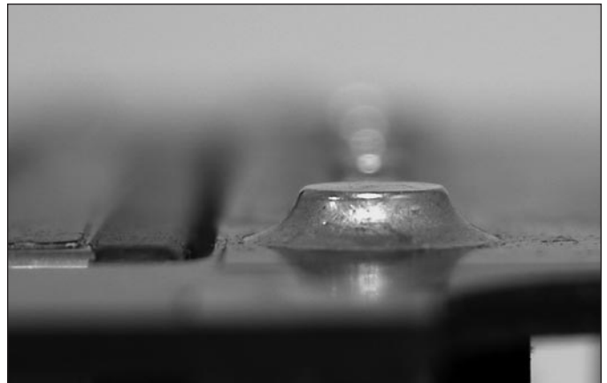
Figure 2 — Side profile of a Mini module solder joint

During the soldering process wetting can be identified by an even coating of solder on the barrel and pin. In addition to coating the surface of barrel and pin, the solder will gather at the intersection of the two and produce a trailing fillet along each surface. Once wetting has occurred, then upon solidification it will bond appropriately to both components, producing a quality connection. Figure 2 shows a side profile of a good solder joint with a Mini power module. Notice that for both examples the solder forms a concave meniscus between pin and barrel. This is an example of a properly formed fillet and is evidence of good wetting during the soldering process. The joint between solder and pin as well as solder and pad should always exhibit a feathered edge. In Figure 2 it can also be seen that the solder covers a good deal of the surface area of both the pin and the pad. This is also evidence of good wetting. Notice also that the solder joint has a smooth surface with a silver color. This is evidence of good immobilization of the joint during cooling as well as