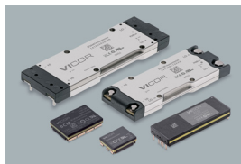
BCM bus converter modules

Inputs: 36 – 60V 38 – 55V 200 – 330V 240 – 330V 260 – 410V 330 – 365V 400 – 700V 500 – 800V