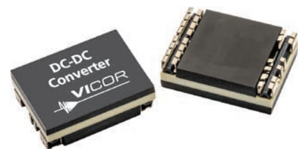
PI31xx 0.87 x 0.65 x 0.265in [22 x 16.5 x 6.7mm]